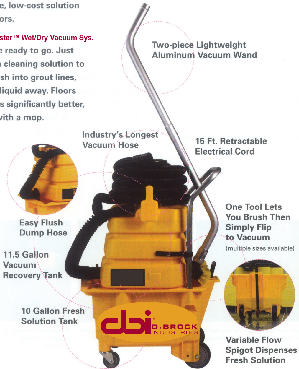
Two-piece Lightweight Aluminum Vacuum Wand

Daily Floor Cleaning Degreasing Kitchens Cleaning Restrooms Stripping Waxed Floors Spill Pick-up Flood Pick-up