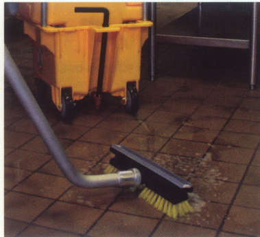
Brush the floors with the bristled side of the Squeegee Head Brush.