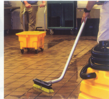
Divide and conquer. Breaks apart to support multiple simultaneous activities.