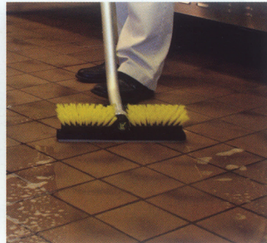
Transition to vacuuming with a quick flip of the Squeegee Head Brush.