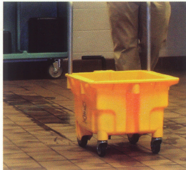
Dispense fresh solution through throttle spigot on the rear of the Trolley-Bucket.